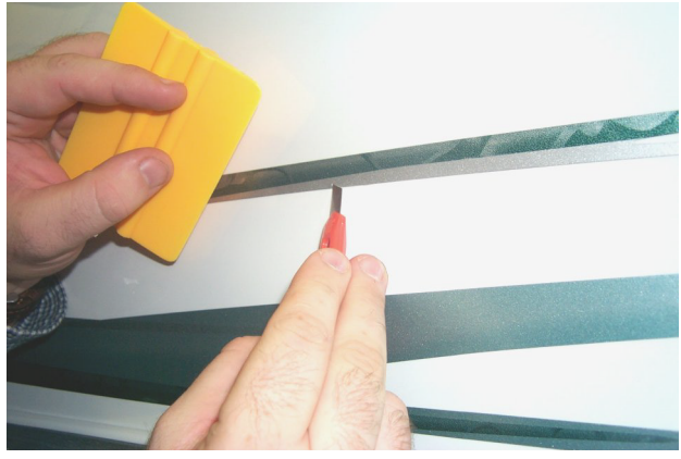
8. If any small bubbles appear during installation, they can be removed by pricking the base of the bubble with the knife blade and squeezing the trapped air out with the tip of your finger.