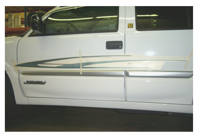
2. Tape the component graphic panels onto the side of vehicle to determine exactly where you want the graphic panels installed. Apply a strip of tape vertically through the center of each component and lightly tape each end of the graphic panel to the vehicle.