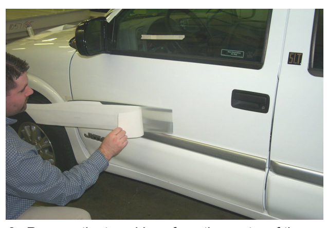
6. Remove the tape hinge from the center of the graphic. Remove the remaining backing paper, spray applications solution on the application surface and squeegee the remaining half of the panel onto the vehicle using the same method as outlined in Step 5.