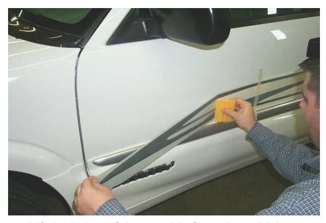
5. Lift the edge of the graphic from the vehicle surface and use the squeegee to rub the graphic into place using short, overlapping strokes from the center of the graphic to the end. By holding one end of the graphic off the vehicle surface as you squeegee, you will prevent air from becoming trapped underneath the graphic's surface.