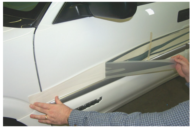
3. Remove the positioning tape on either side of the center hinge from the first panel and peel the liner paper away from this portion of the graphic. Lightly tape the graphic to the vehicle surface (as illustrated in Step 4).