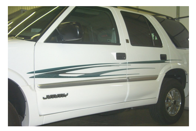
10. Repeat steps 3 through 9 on any remaining graphic panel(s).