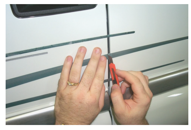
9. Trim away excess graphic material from door edges by inserting the knife along the edge of the opening at a 45-degree angle. Then carefully cut through the vinyl on both sides of the seam and remove the scrap.