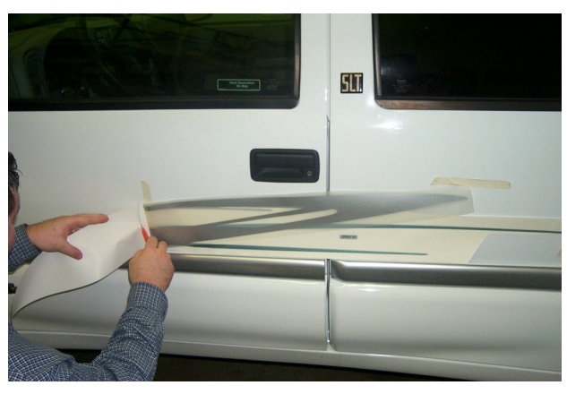
4. Temporarily secure the end of the graphic to the vehicle surface and cut the backing paper off near the center hinge.