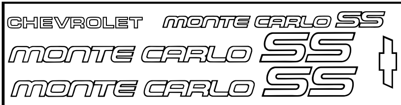
K-3 5.6" x 26.5