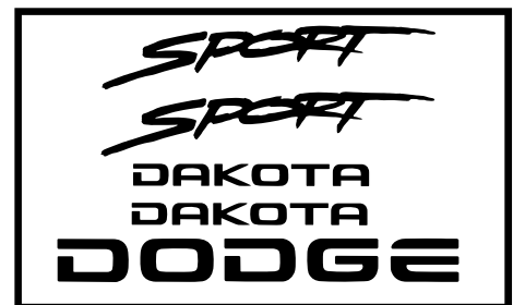
K-5 11.75" x 18.3"