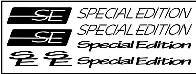
K-1 4.4" x 13.33"