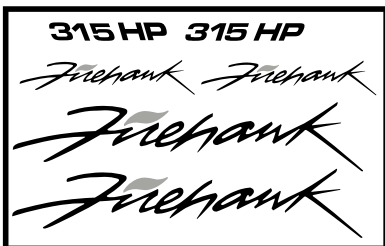
K-6 9.75" x 16.5"