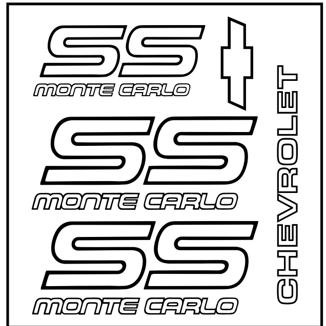
K-2 11.5" x 10.25"