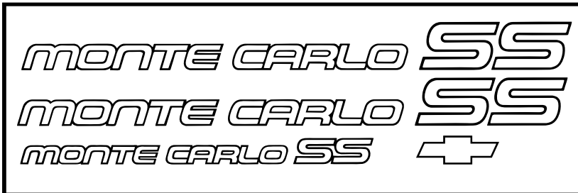
K-4 6.15" x 23.8"